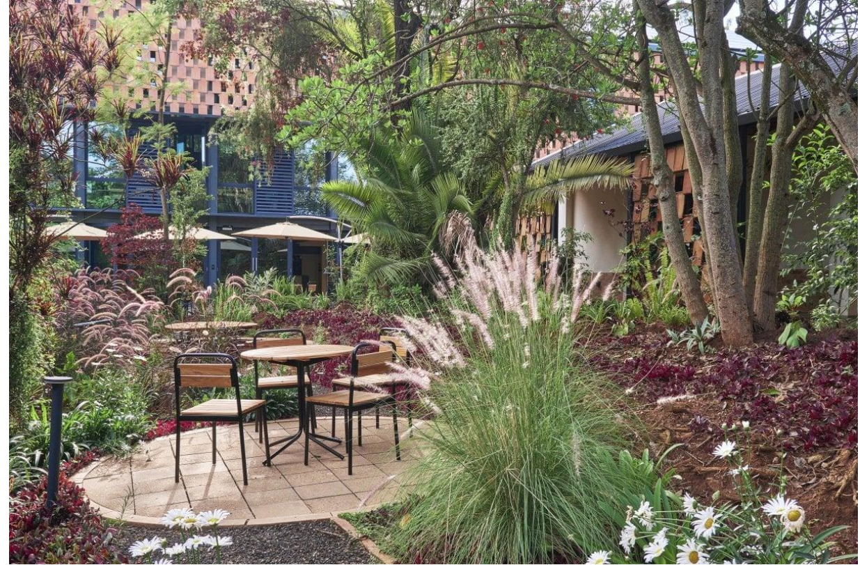
Photo: Outdoor landscape and shaded outdoor seating areas